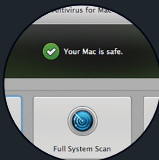
Mac OS X