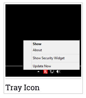
Update Now - starts an immediate update. You can follow the update status in the Update panel of the main Bitdefender window.

The Bitdefender system tray icon informs you when issues affect your computer or how the product operates, by displaying a special symbol, as follows: