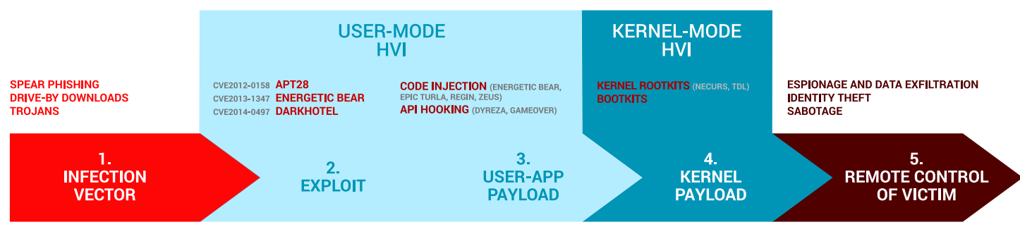
UM HVI is strongly isolated (enforced by hardware) and provides generic detection mechanisms

HVI already detects and blocks famous targeted attacks including Carbanak, Turla, APT28, NetTraveler or Wild Neutron without knowing beforehand the actual vulnerabilities used by the hackers.