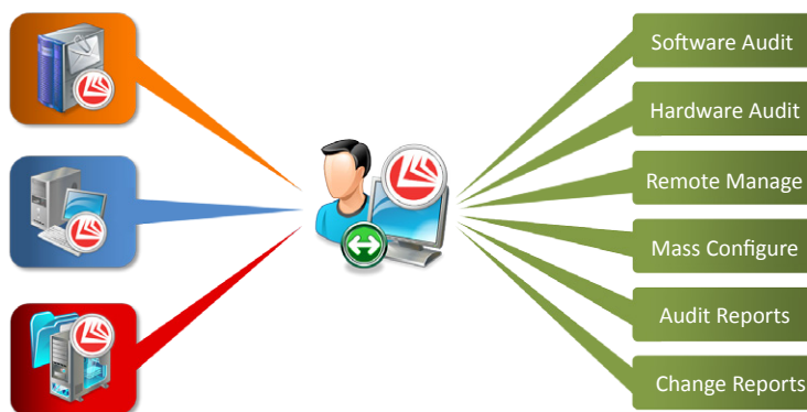
BitDefender's Network Tools can remotely manage and audit organization's network from a centralized location