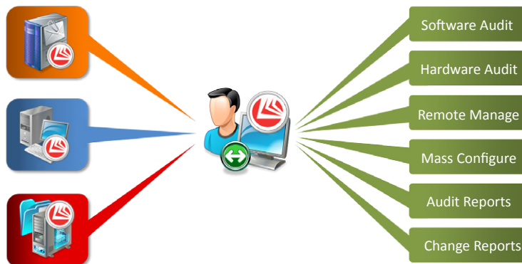
BitDefender's Network Tools can remotely manage and audit organization's network from a centralized location